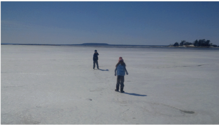
April 20, 2014 – a couple of little Deeks looking west across the solid ice from Minnicog to Kitchikewana's Tomb